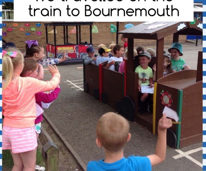
23rd June 2017 Year 1 Seaside Day