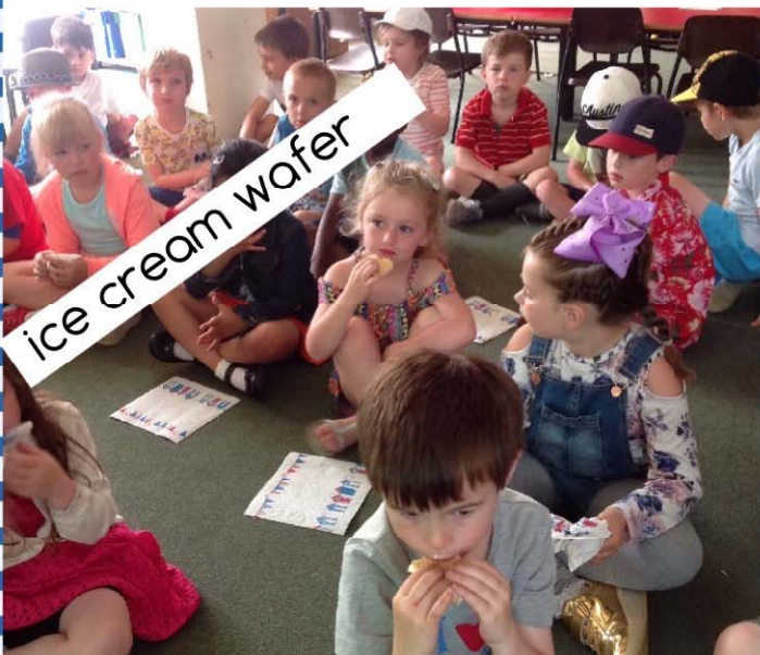
ice cream wafer