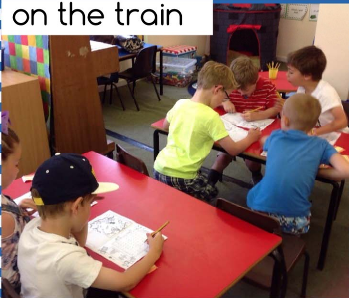
on the train