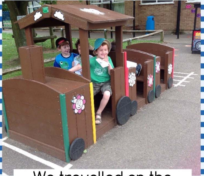
We travelled on the train to Bournemouth